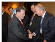
Equus on horizon