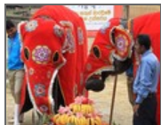
All decked out fo...