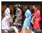
Showing off their...